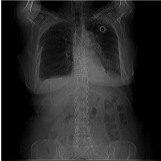
Figure 2: Chest x-ray two months after discharge

During her octreotide treatment, the patient experienced low-grade fever, minor hyperglycemia, and diarrhea for the first few days of octreotide initiation, which resolved after two days when octreotide was stopped accompanied by lab tests to investigate the origin of fever. No infectious etiology was delineated. Mild temperature elevated again after patient was started back on octreotide, and the temperature resided after a few days of treatment.