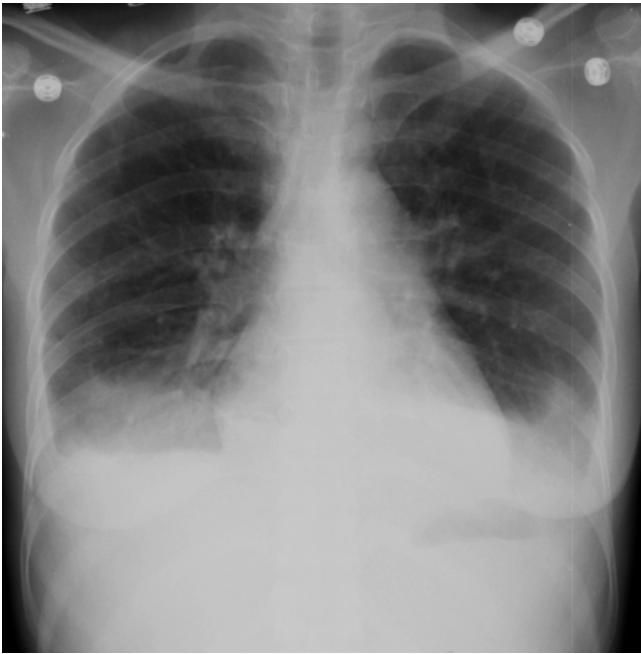
Figure 2. Bilateral pleural effusions and lower lobe infiltrates seen on chest x-ray.