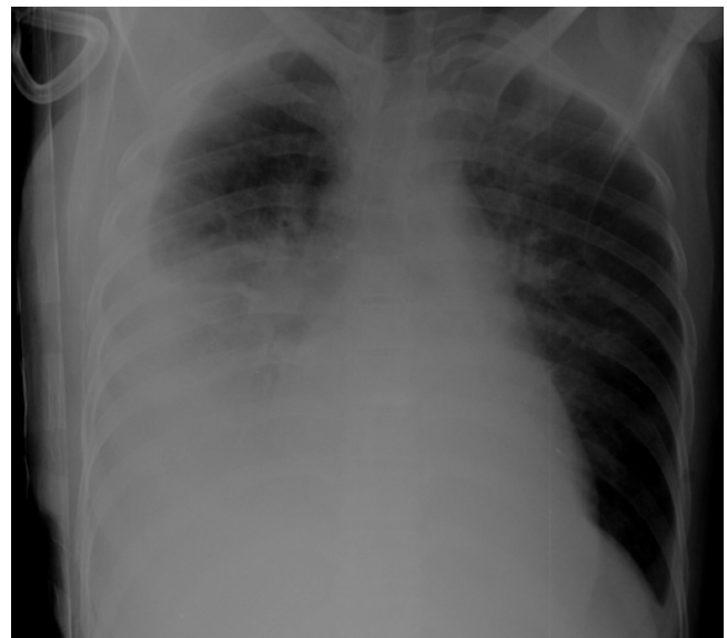
Figure 4. Lateral decubitus chest x-ray demonstrates layering of effusion on right and bilateral consolidation.

In the second hospital week, patient continued to have fever on broad spectrum antibiotics. She consented for bronchoscopy finally but developed shortness of breath the following day. Her saturation at room air was found to be 64% and chest x-ray showed worsening of bilateral infiltrates and effusions, with right side more severely involved than left (Figure 4). Therapeutic thoracentesis was done. 850 ml fluid was drained from right side and 550 ml from left side. Pleural fluid was transudative, and cultures were negative. AFB and silver stains were negative, and there were no malignant cells.