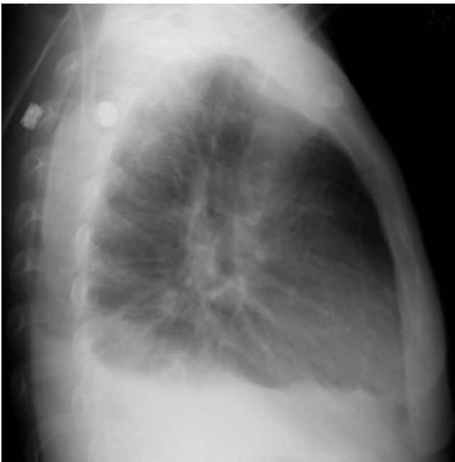
Figure 3. Bilateral pleural effusions and lower lobe infiltrates seen on chest x-ray.

Laboratory work-up showed leukocytes of 4400/cm but a bandemia of 28% and an elevated sedimentation rate of 65 mm/hr. Initial chest x-ray showed prominent bilateral septal lines, which was reported as interstitial disease vs. viral pneumonia (Figure 1). Tuberculin skin test was positive (21 mm), but three acid-fast bacilli smears (AFB) were negative. Pan-cultures and influenza, HIV antibody and viral load, hepatitis, malaria, parvovirus, Epstein-Barr virus, and histoplasma tests were all negative. Syphilis, neisseria gonorrhoeae, and chlamydia tests were negative.